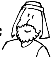
James, son of Alphaeus